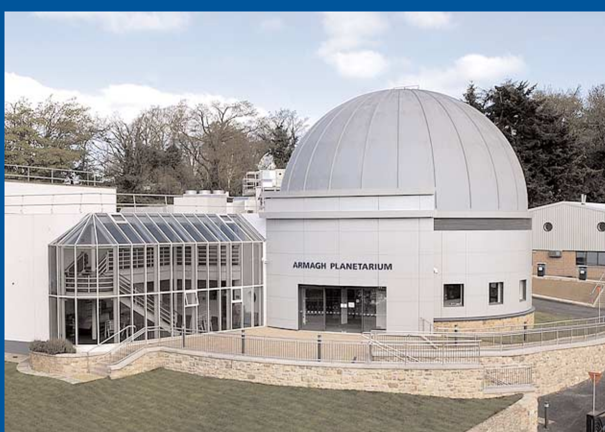
Armagh Planetarium's landmark dome

Planetaria became popular worldwide after the Second World War. Since then audiences have been fascinated by spectacular star shows. As technology has become more sophisticated, the audience's experience has become ever more thrilling and realistic. Many large cities now have their own planetarium – with Armagh being the first planetarium in Ireland.