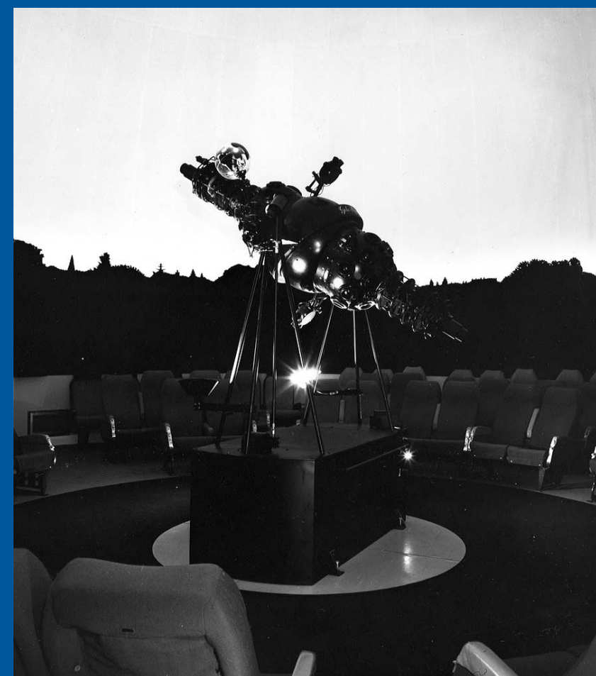
Right: Armagh Planetarium's classic Viewlex-Minolta dumbbell projector